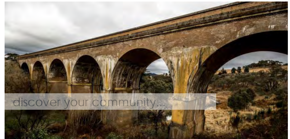
discover your community...

Lithgow itself has a number of historical buildings, monthly markets, restaurants, shops and places of interest.